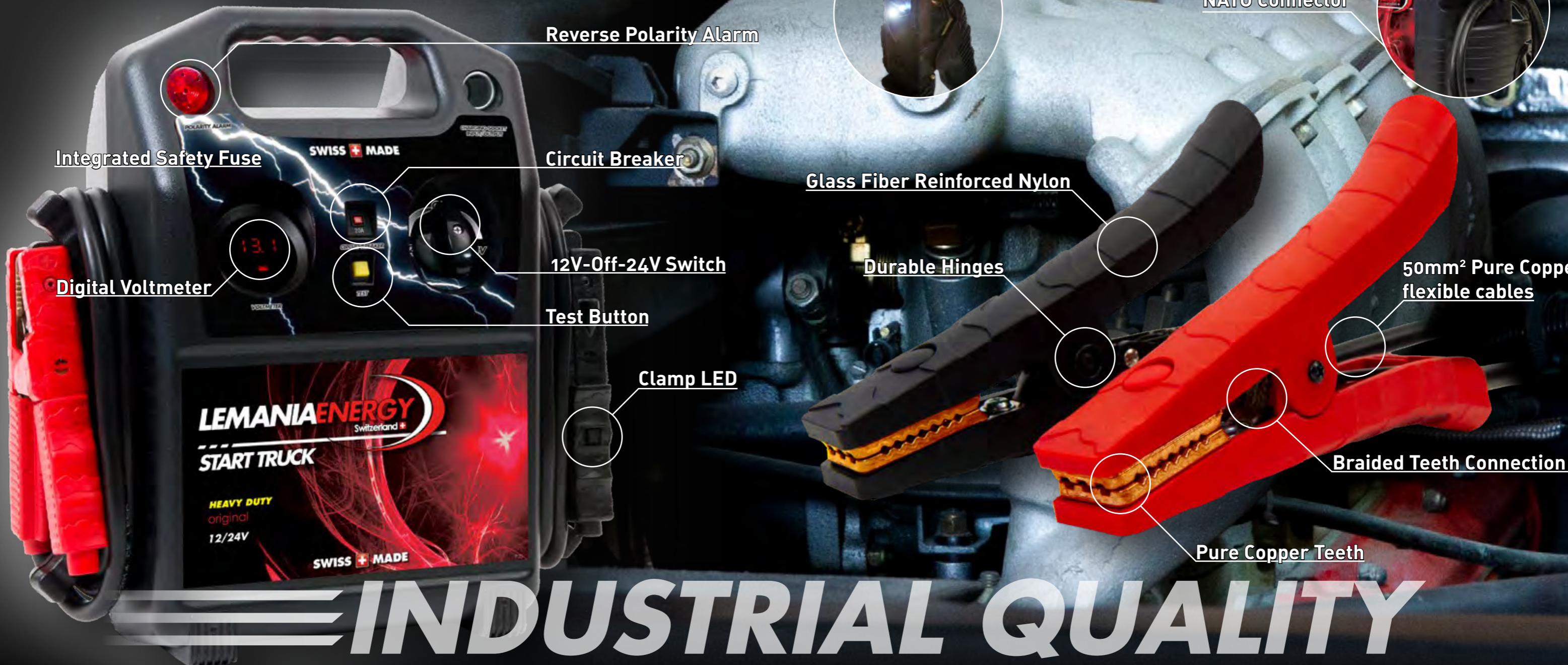
Reverse Polarity Alarm